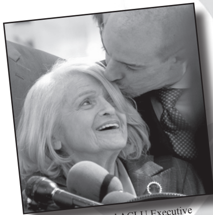
Edie Windsor and ACLU Executive Director Anthony Romero